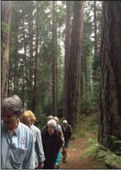
Adult Hike, Heart Lake Old Growth