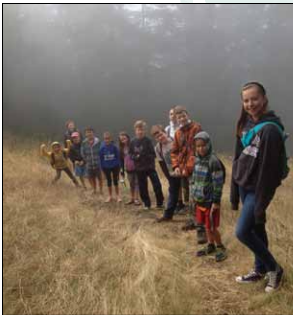
Forest Discoverers hiking Sugarloaf Mountain - Summer 2014

Forest Discoverers immerse all of thier attention in Big Beaver Pond.