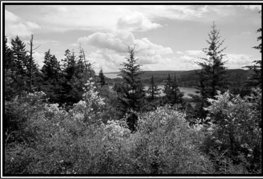
View looking south from a rocky bald on the Udd Property