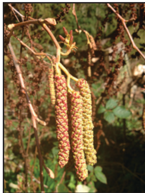
Alder Catkins are more subtle, but their beauty is revealed if one looks closely.