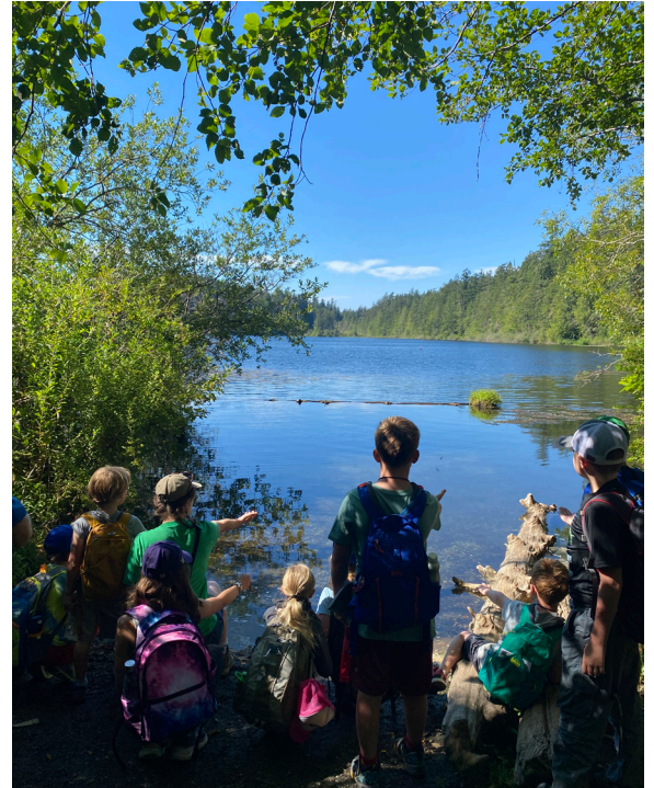
Campers dragonfly-whispering at Heart Lake

We spotted more than just invertebrates on the trail: over the month, campers watched osprey dive into the waters of Little Cranberry, saw a family of barred owls teach this year's juveniles the basics of hunting, and witnessed a dramatic squabble between a band of crows and an intrusive red-tailed hawk at the top of Sugarloaf. Campers dove into investigations of trailside scat and other clues that pointed