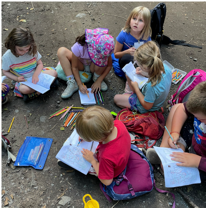
Nature Journaling at Whistle Lake

Campers also challenged themselves with brain teasers, riddles, and other trailside games. They melded minds with other campers and together crafted collaborative stories, woodland art pieces, and - for one group - an entire new society built on the economic power of a pine cone scale. It was amazing to see how naturally the groups' curiosity, collaboration, and teamwork flourished against the backdrop of the ACFL.