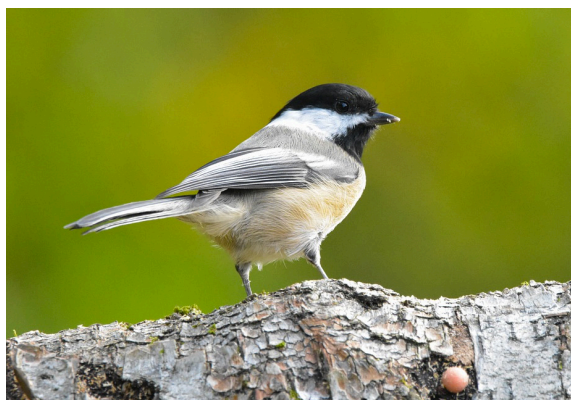
A Black-capped Chickadee perches on a log, ready to sing in the change of seasons (one would suspect)

Chickadees, foraging in the tips of the Western Hemlock slightly above my head. I heard leaves rustling on the forest floor, coming from a Towhee scratching and sifting leaf litter for food. And I heard its grating scree, which is not cute, but I guess that's not their fault.