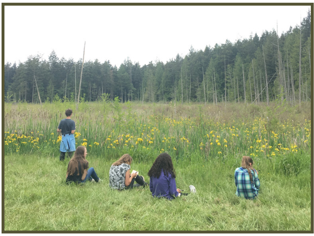
Watershed Discovery students write quiet observations on a field trip near 32nd St. Swamp.